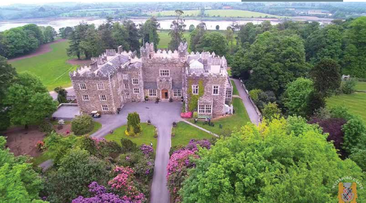
ABOVE: Waterford Castle is an imposing 19-room hotel that sits on its own private island on the King's Channel, an estuary of the River Suir.