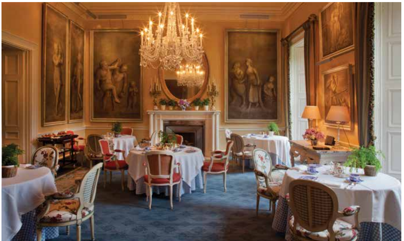
PREVIOUS PAGE: Castle Durrrow; TOP: Ballyfin's medieval-style tower was built as a folly in the 1860s. BOTTOM: Dining room at Ballyfin, one of Ireland's most lavish Regency mansions, reflects the exquisite style found throughout the house.