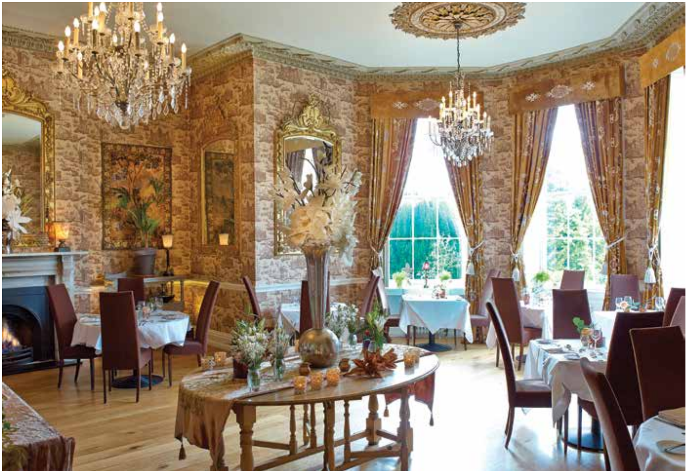
ABOVE: The elegant dining room at Castle Durrow is adorned with hand-blocked wallpaper, a direct copy of eighteenth century Chinoiserie paper reminiscent of the Byzantine and Chinese empires.