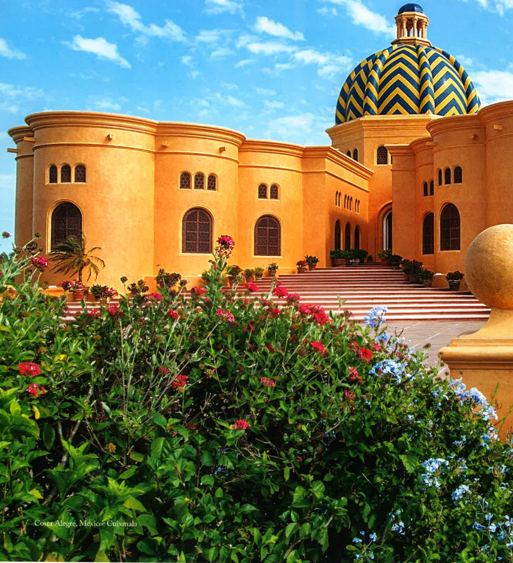
Costa Alegre, Mexico: Cuixmala