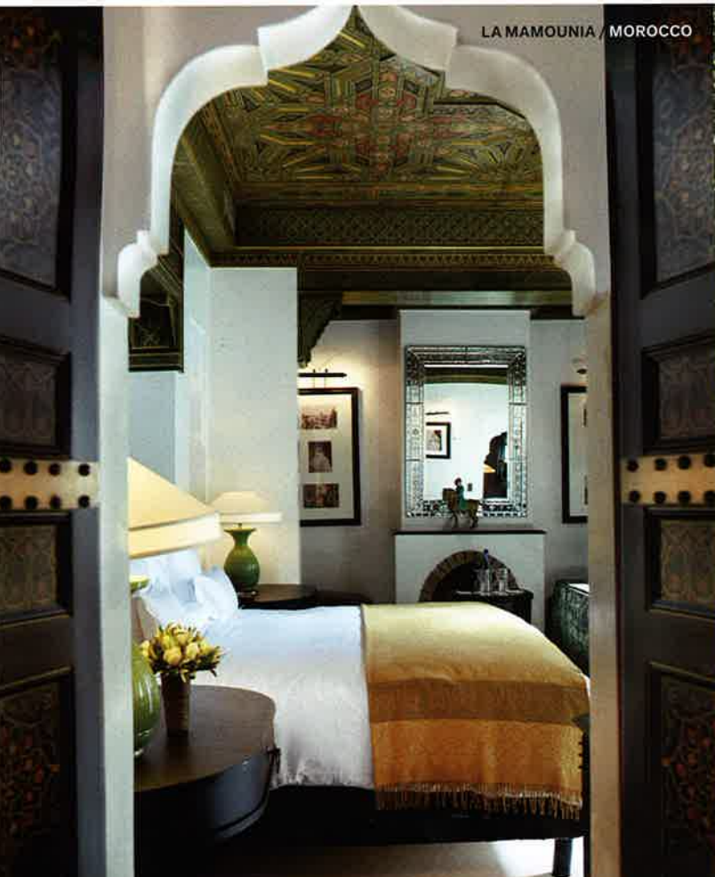
LA MAMOUNIA / MOROCCO