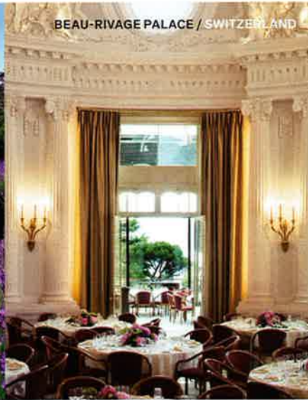
BEAU-RIVAGE PALACE / SWITZERLAND

a Bahamian fish fry with the lobster, snapper, or grouper you've caught. Doubles from $775; excursion and class , $450; kamalame.com .