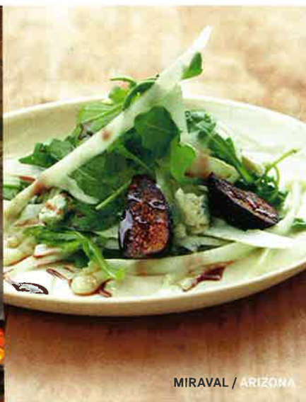
MIRAVAL / ARIZONA