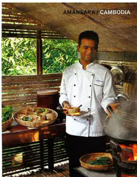
AMANSARA / CAMBODIA

the fruits of your labor in a beautiful setting. We've gathered our favorites here. Kamalame Cay, The Bahamas At this laid-back property on a private cay, the cooking class starts in a skiff among turquoise shallows, where you'll spear your supper with help from a guide. Back in the kitchen, prepare sevice or