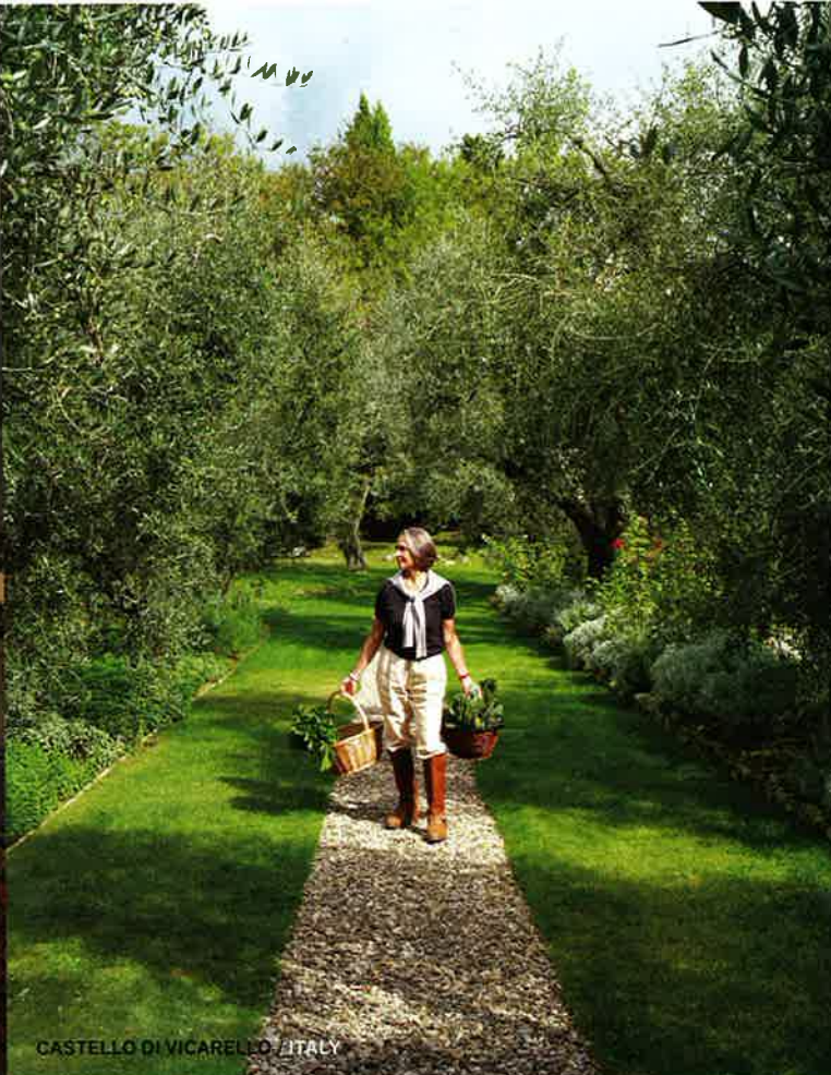
CASTELLO DI VICARELLO / ITALY