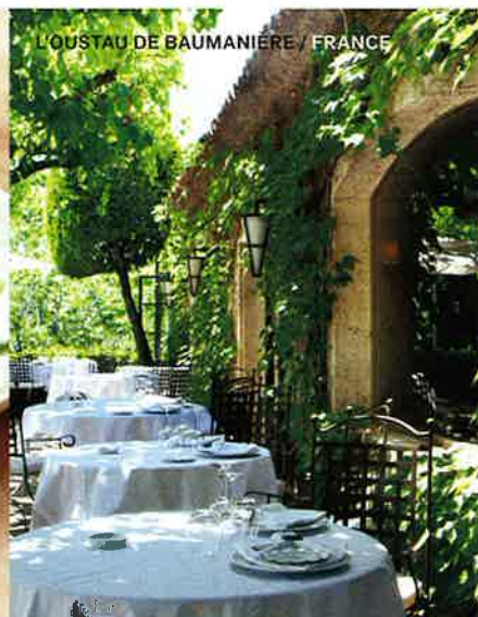
L'OSTAU DE BAUMANIÈRE / FRANCE