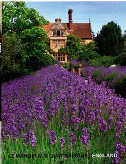
LE MANOIR AUX QUATRE SAISONS / ENGLAND