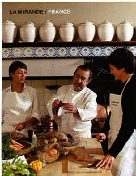
LA MIRANDE / FRANCE