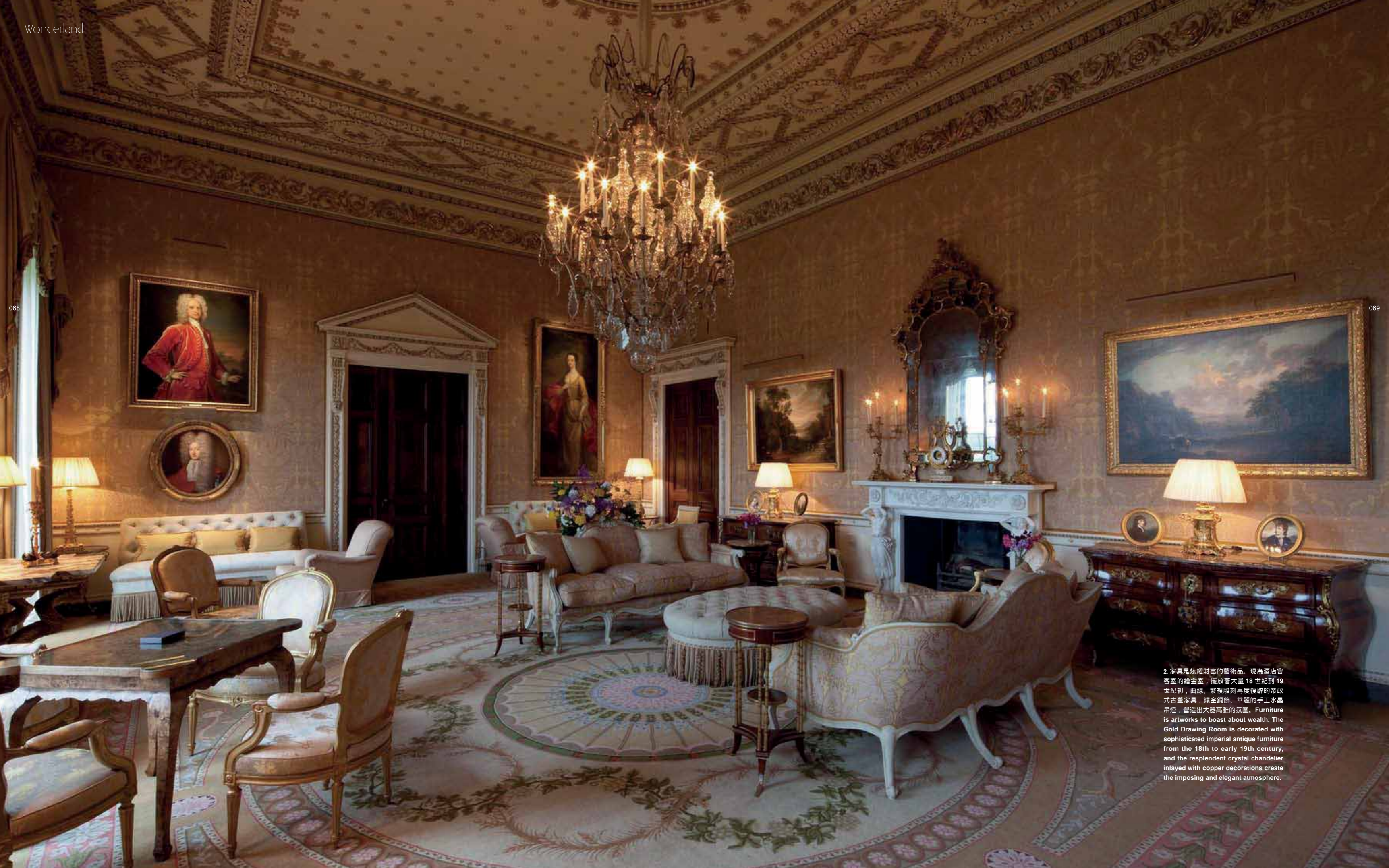
2. 家具是炫耀財富的藝術品。現為酒店會客室的繪金室，擺放著大量 18 世紀到 19 世紀初，曲線、繁複雕刻再度復辟的帝政式古董家具，鑲金銅飾、華麗的手工水晶吊燈，營造出大器高雅的氛圍。Furniture is artworks to boast about wealth. The Gold Drawing Room is decorated with sophisticated imperial antique furniture from the 18th to early 19th century, and the resplendent crystal chandelier inlaid with copper decorations create the imposing and elegant atmosphere.