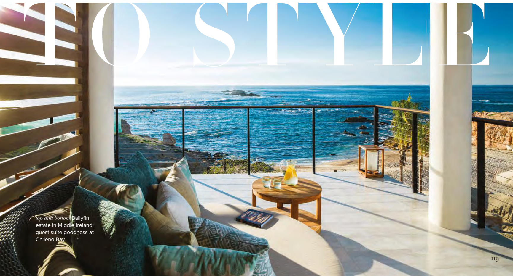
top and bottom Ballyfin estate in Middle Ireland; guest suite goodness at Chileno Bay.

Escape to an authentic Swiss MOUNTAIN RETREAT, experience unmatched LUXURY BY THE WATER in Cabo and indulge in the elegant charm of an IRISH ESTATE.