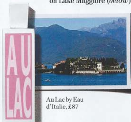
Au Lac by Eau d'Italie. £87

Scent is one of the most evocative pleasures of travel, and each perfume by Eau d'Italie transports the imagination. PORTER's favorite, Au Lac, is inspired by the passionate love affair between Princess Vittoria Colonna and futurist painter Umberto Boccioni, which unfolded in the summer of 1916 against the backdrop of Isolino, Colonna's island retreat on Lake Maggiore (below).